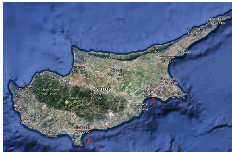
Figure 1. Location of the Sovereign Base Areas of Cyprus; 1 indicates the location of Akrotiri and 2, Dhekelia

Our project aims to monitor the potential future threat from invasive alien species on the Sovereign Base Areas (SBAs) of Cyprus. The main areas we have been surveying are Akrotiri and Dhekelia (see Figure 1 below):